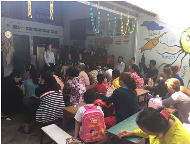
SCC-CBE School Parents Meeting