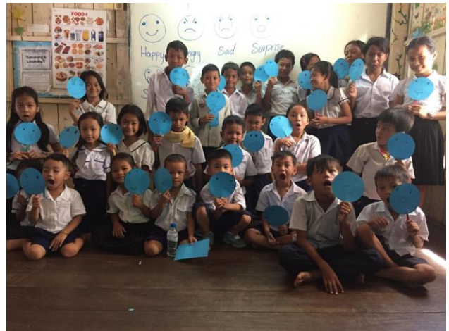
Children drawing and showing stickers