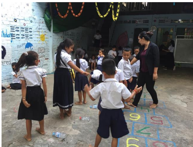
Playing game during a break