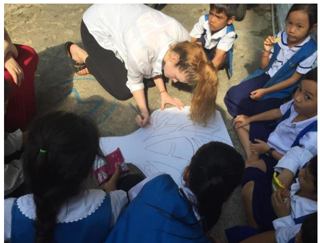
Volunteer teaching drawing map