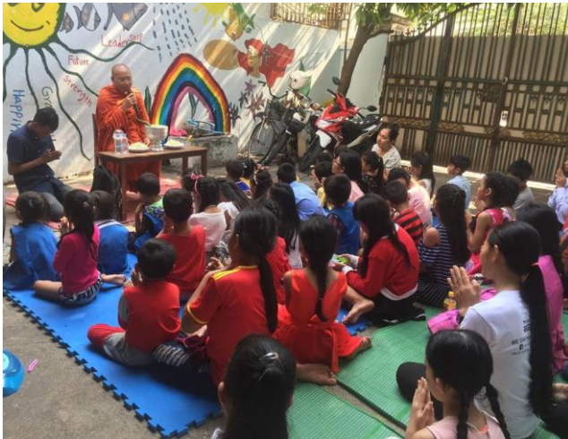
SCC monk gave advices to children and teachers