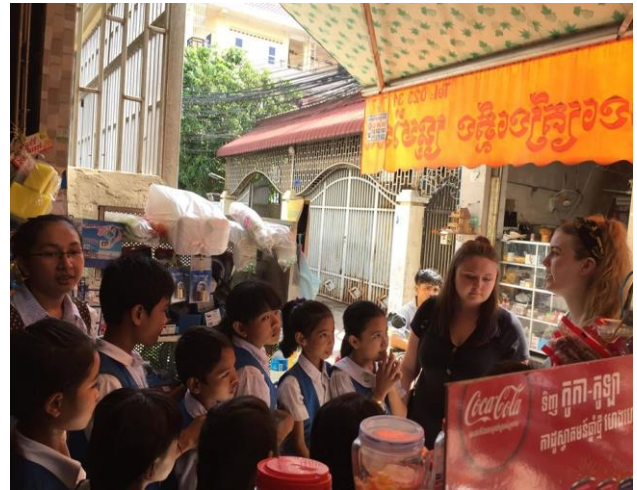
Teachers and volunteers conducted Field Trips