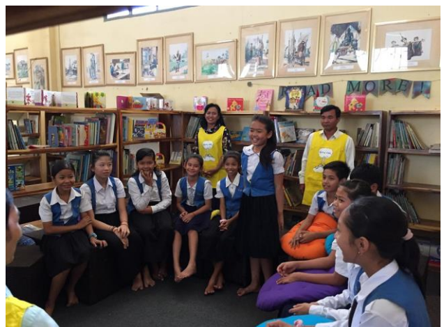
Our children had invited to the National Library of Cambodia to reading books, listen to the stories and they are so happy.