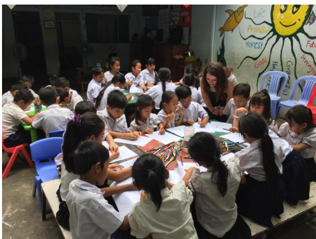
CBE teachers taught our children how to coloring the mandala