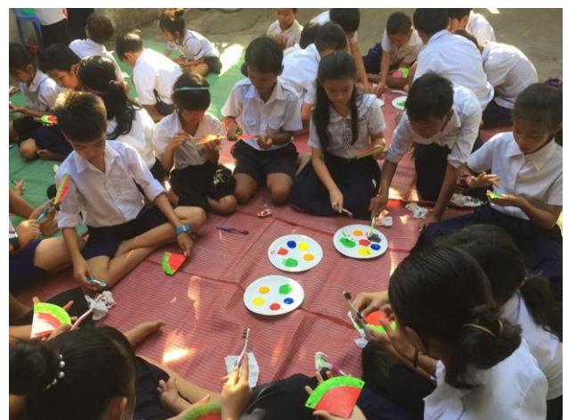
CBE teachers taught our children how to make a crafts by using the pieces of paper plate and coloring type of fruits.