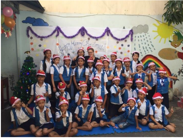
Group photo of CBE children & teachers