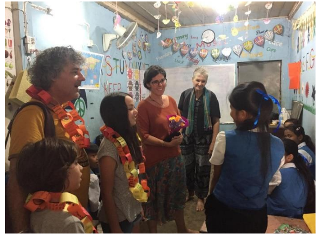
Our visitors come to visit SCC-CBE School