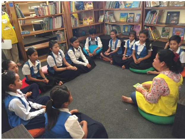
Our children had invited to the National Library of Cambodia to reading books and listen to the stories.