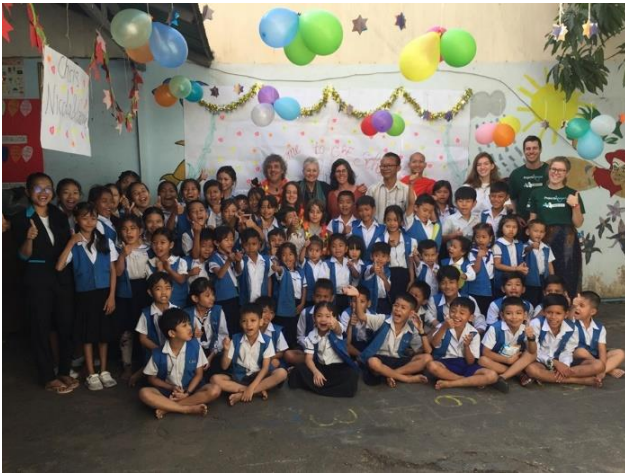
Group photo of Children & SCC staff including teachers