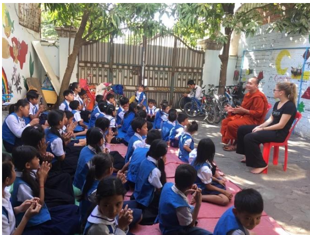
The Children received moral education from SCC Monk.

Happy Happy Program was conducted on 13 th December 2019 by SCC’s staff members including CBE teachers for children at the SCC-CBE School located in Phnom Penh with 63 children of which 29 are were girls participated in this activity. In the program, the children played together, explored their skills and learned from each other. They were also able to build new relationships with one another and strengthen existing ones. During the program, the pupils were very happy together: They learned some new skills unconsciously, interacted with each other, shared knowledge, played educational games and enjoyed refreshments. It was a great opportunity to strengthen their relationships and grow together as a community. Through having fun, our children were encouraged and motivated to study at CBE School and state schools regularly. This activity promoted our SCC-CBE School and informed students and parents about their options and possibilities in the education offered, and encouraged more children to join the SCC-CBE School. Additionally, this program aimed to end stigma and discrimination against vulnerable children.