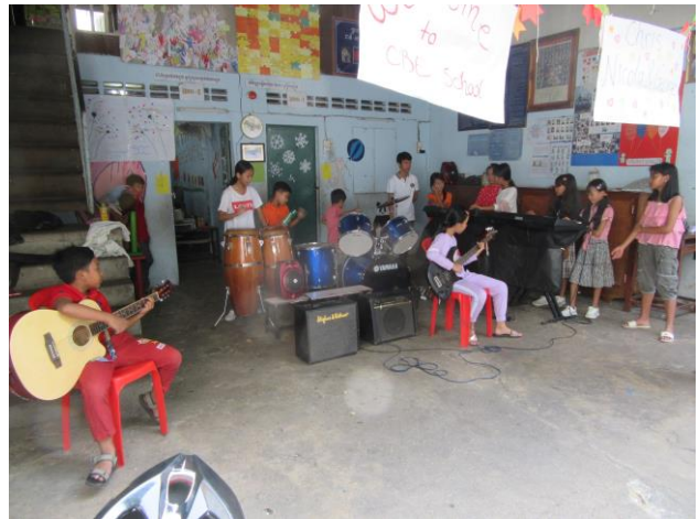
Our children are practicing to play the piano, guitar, twin drum and conga drum with their coach.