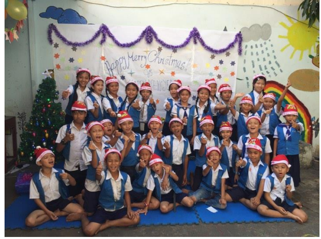
Group photo of CBE children & teachers

Happy Happy Program was conducted on 13 th December 2019 by SCC’s staff members including CBE teachers for children at the SCC-CBE School located in Phnom Penh with 63 children of which 29 are were girls participated in this activity. In the program, the children played together, explored their skills and learned from each other. They were also able to build new relationships with one another and strengthen existing ones. During the program, the pupils were very happy together: They learned some new skills unconsciously, interacted with each other, shared knowledge, played educational games and enjoyed refreshments. It was a great opportunity to strengthen their relationships and grow together as a community. Through having fun, our children were encouraged and motivated to study at CBE School and state schools regularly. This activity promoted our SCC-CBE School and informed students and parents about their options and possibilities in the education offered, and encouraged more children to join the SCC-CBE School. Additionally, this program aimed to end stigma and discrimination against vulnerable children.