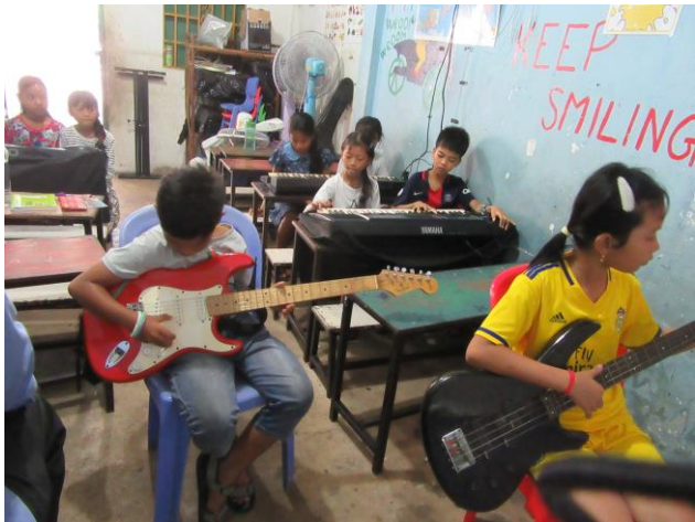
Our children are learning how to use the symbols of music with their coach.