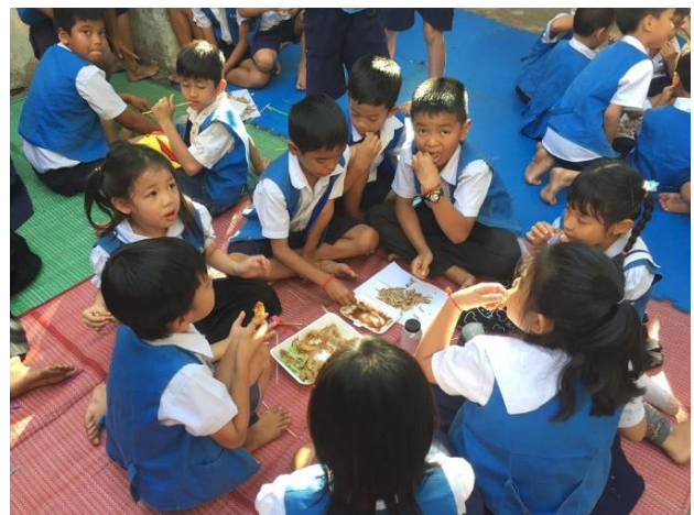
The Children ate refreshment after ending the program