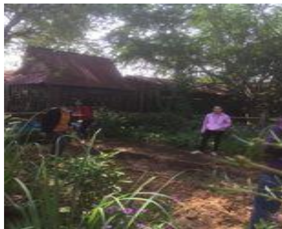
SCC-CBE teachers planting banana trees, papaya, mango, flowers and herbs in the garden on June 2021