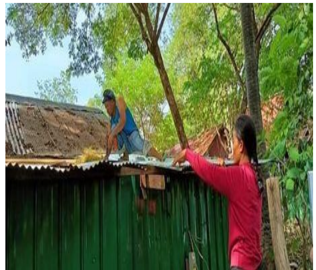
SCC-SBE staff removed the old zinc of the roof in the kitchen building instead the new one on June 2021