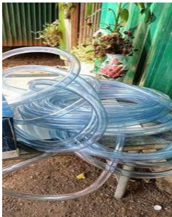
Preparing a place to keep the new monitor for pumping water supplies in CBE School on 13 May 2021.