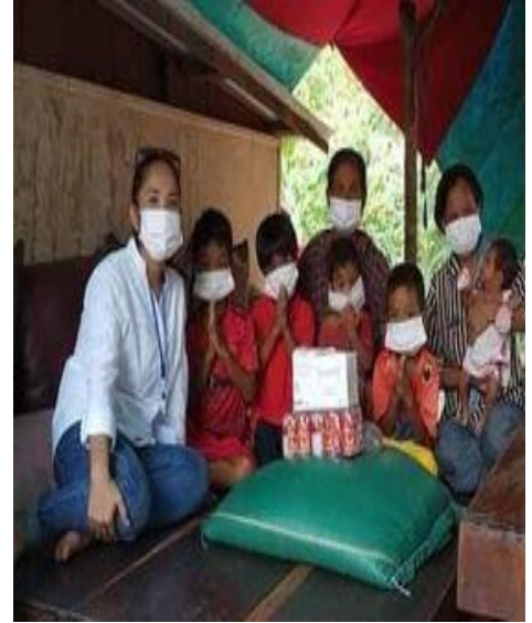
SCC-CBE Students and their families received the nutrition support at CBE School on 13 May 2021

The received people express their feeling that “These gifts were absolutely helpful and they thanked to the sponsor who donated these nutrition during outbreak of Covid-19” .