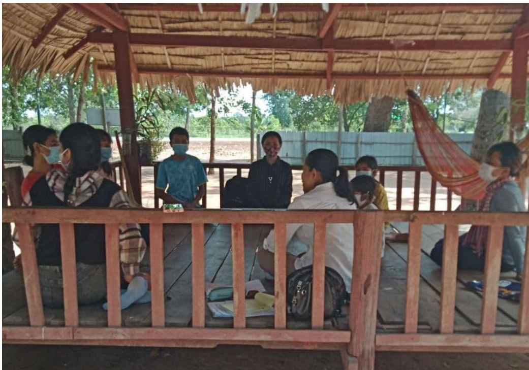
SCC-CBE School supervisor has a meeting with scholarship students on 8 June 2021

routines, family situation, and checked their email. Furthermore, she suggested the 4 big students to make a video message to their sponsor 1 clip each.