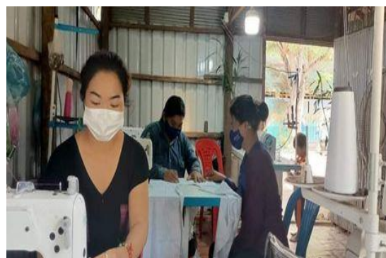
Photos of Ladies sewing class located in SCC-CBE School on May 2021

In year 2021, we have 5 more ladies who are from community learning sewing skill at SCC-CBE Christine School. This program is continuing day by day and it is running well.